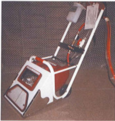
Steamin Demon® Classic