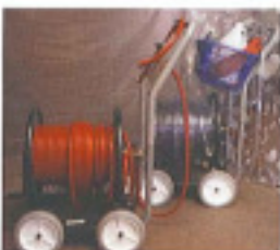
Hose Reels (for large facilities)