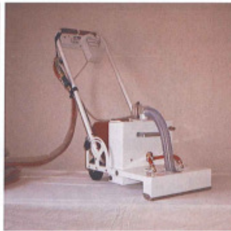
Steamin Demon® XL-15