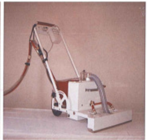
Steamin Demon® XL-20